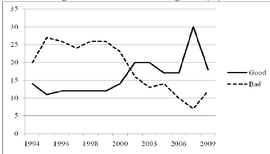
Figure 2 Evaluation on life in general (%)